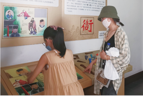
A girl plays with a puzzle with her mom at the show.

Visitors are required to make advance reservations through Jiading Museum’s official WeChat account and must wear a mask at all times in the museum.