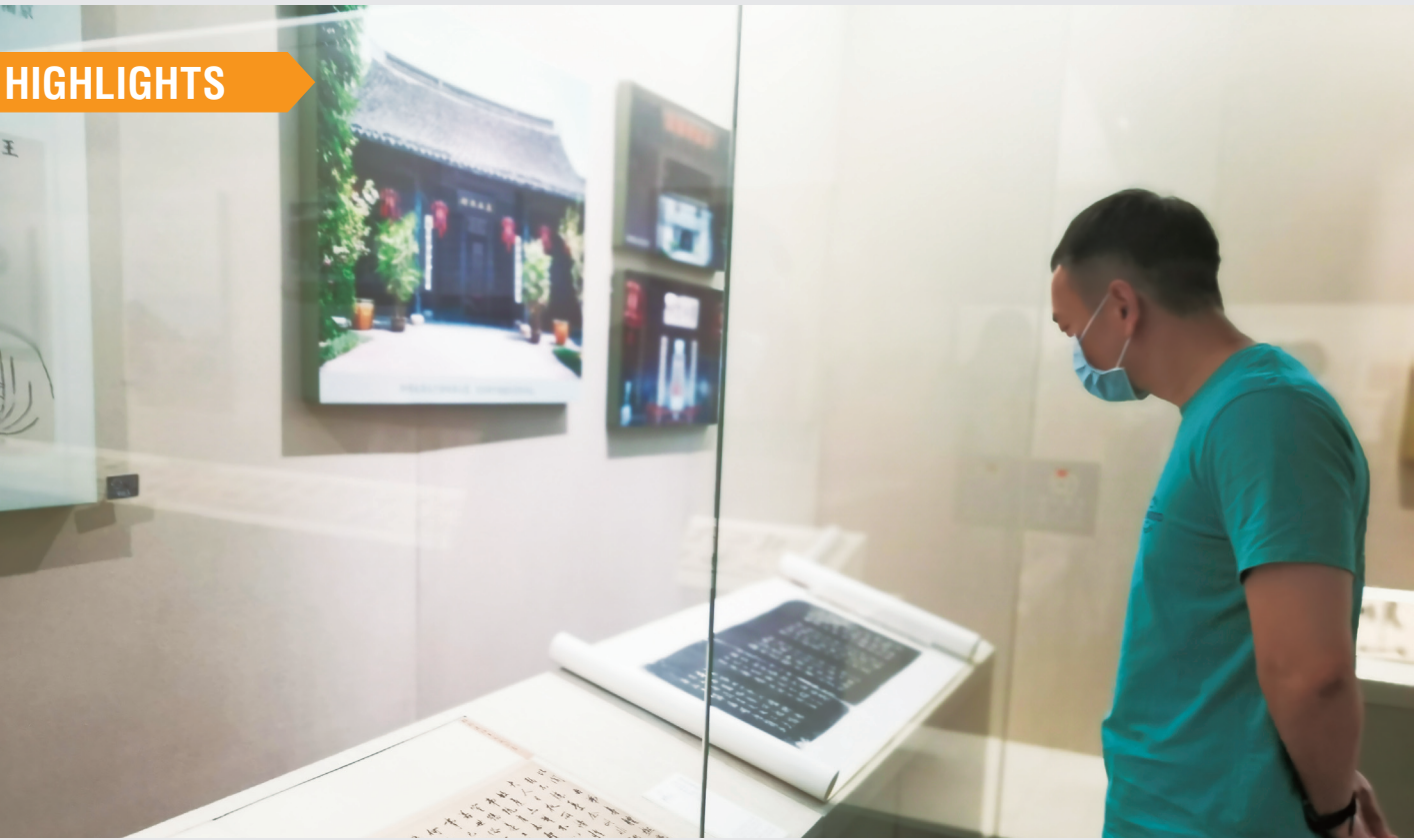
A visitor observes a piece of rubbing by Wang Yangming, one of the most significant Chinese philosophers during the Ming Dynasty, at Jiading Museum. The exhibition runs through September 25.

IN cooperation with Shaoxing Museum, the exhibition “A Story of Yangming” is on display at Jiading Museum, introducing the life and philosophy of Wang Yangming (1472-1529), one of the most significant Chinese philosophers during the Ming Dynasty (1368-1644).