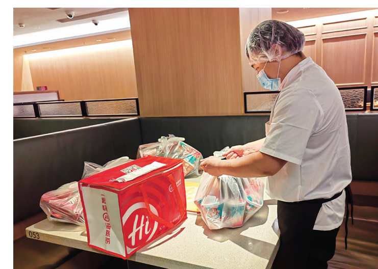
Workers in Haidilao Hotpot in CITIC Pacific Wanda Plaza cook (far above) and package food.