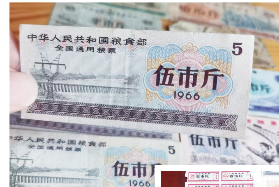
Above: National food coupons issued in 1966, with a face value of 5 shijin (2.5kg)