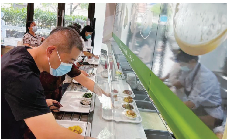
Customers take the food at the counter in the Home Restaurant in Malu Town's Lujia neighborhood.

There are currently two Home restaurants in Malu Town, and the other is in the Zhongfang neighborhood. Three more will open this year in Baiyin, Xiwang and Xinlian neighborhoods.