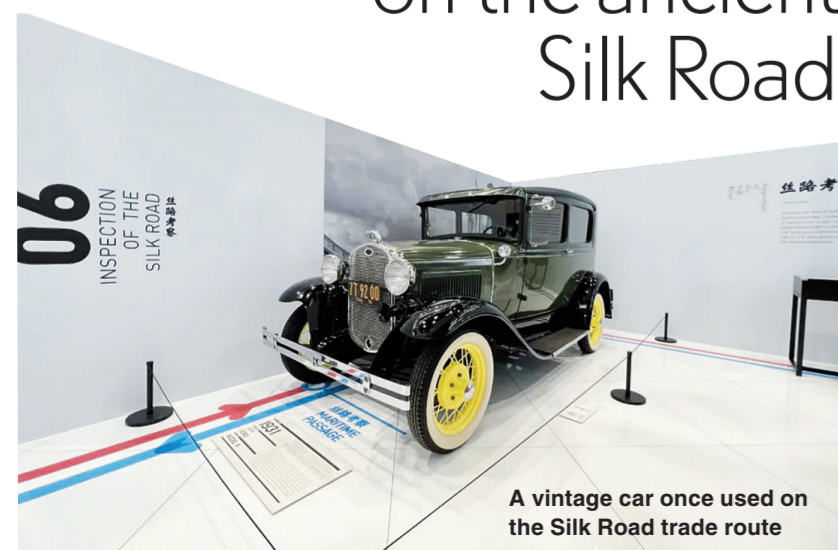
A vintage car once used on the Silk Road trade route