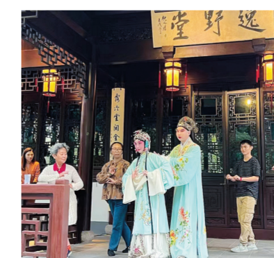
Viewers are invited onto the stage to learn specific postures and movements from the professional performers during an interactive session. — Li Pin