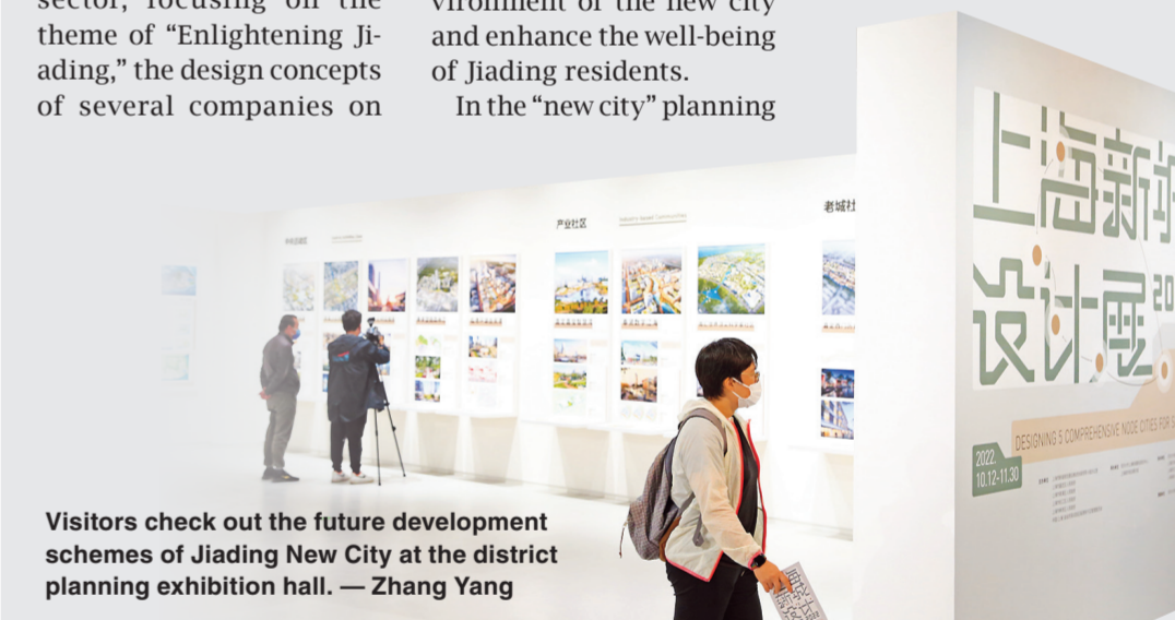
Visitors check out the future development schemes of Jiading New City at the district planning exhibition hall. — Zhang Yang

Date: Through November 30, 9am-5pm Venue: Jiading District Planning Exhibition Hall Address: 999 Yining Rd, Jiading Industrial Zone