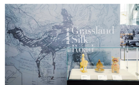
Artefacts on display at the Silk Road exhibition

The exhibition gathers nearly 50 collections from the six museums and interprets the Silk Road through six sections: Silk Road Early Period, Grassland Silk Road, Oasis Passage, Southern