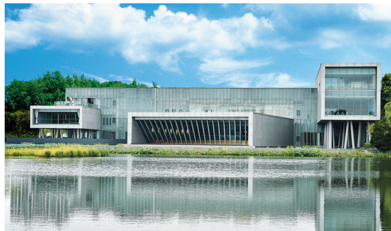
The Jiading District Planning Exhibition Hall, with a total exhibition area of about 4,000 square meters, integrates exhibition, education, cultural exchange and other functions. — Yu Chao