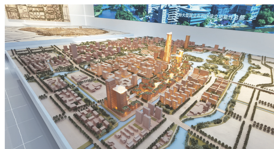
A multimedia sand table showcases the overall planning of Jiading.