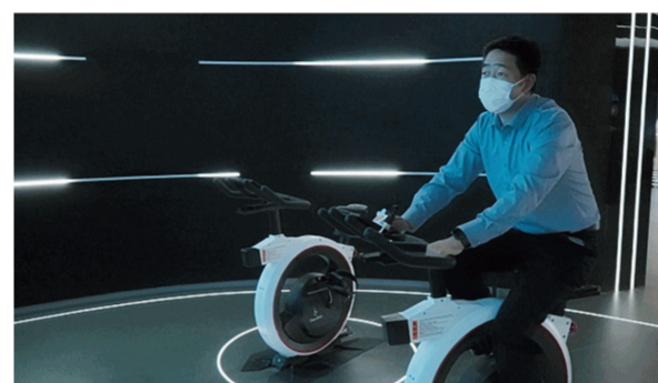
A visitor takes a virtual ride in the Future Experience area.

comprehensive outlook of the future development of Jiading.