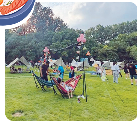
Fun Play Camp