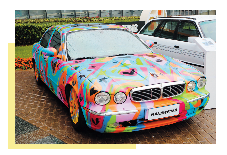
An artistic Jaguar XJ8 donated by Hanswerks Studio is parked during the opening ceremony of the 2022 Shanghai Auto Culture Festival. Through the end of this month, residents in Jiading can take part in a slew of car-themed activities like car boot sale and drive-in cinemas.

Now the rice crops in Anting Town's paddy fields are in good shape, the pomegranates at Anting Old Street are cracking, the ginkgo trees by Yuanxiang Lake are turning yellow, and the chrysanthemums at Huilongtan Park are still in full bloom ... It's that time of the year when the fields are ripe and the harvest plentiful.