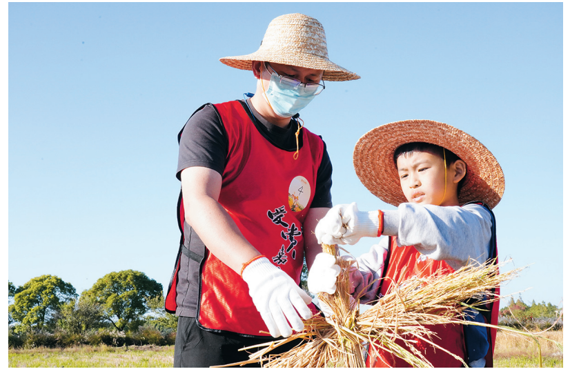
A boy learns how to make a straw scarecrow during a fall-themed event at Jiabei Country Park. — Yang Yujie