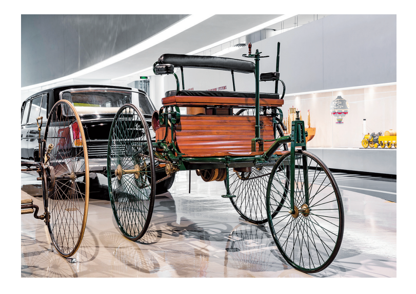
Shanghai Auto Museum Address: 7575 Boyuan Road Opening hours: 9:30am-4:30pm (closed on Mondays)

"Shanghai Brand" SH760A, and BMW E34 are parked, all from the collection of car enthusiast Yang Gang. Tickets are 60 yuan, and you can also have a cup of coffee in the garage for free and enjoy some quiet time.