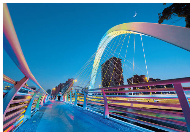
Beishuiwan Bridge Address: Middle section of Pingcheng Road

The design concept of the Beishuiwan Bridge originated from the image of a “Leaping Dragon across Rainbow.” As night falls, a “rainbow” rises into the sky. Standing on the bridge, you can take in the mesmerizing view of the bustling Sunye Shopping Mall, which is one of the most charming landmarks in the Beishuiwan area.