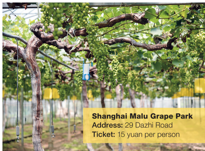
Shanghai Malu Grape Park Address: 29 Dazhi Road Ticket: 15 yuan per person