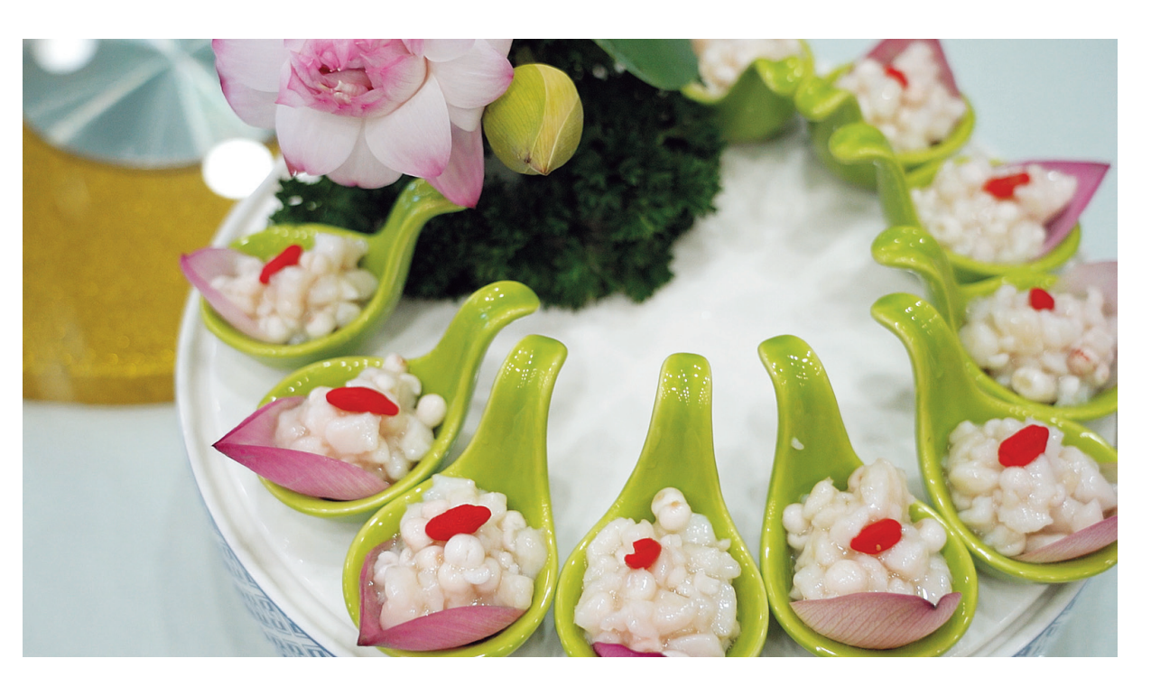
The dish is divided into mouthful-sized spoons in the shape of lotus petals.

Bookings need to be made at least one day prior to a visit at 59124222.