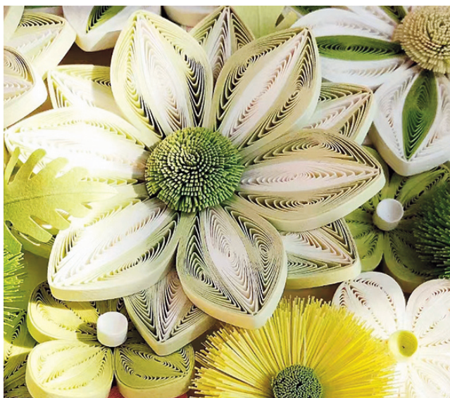
Above: The intricate art of paper quilling requires patience, precision and a skilled hand to create beautiful, three-dimensional designs.