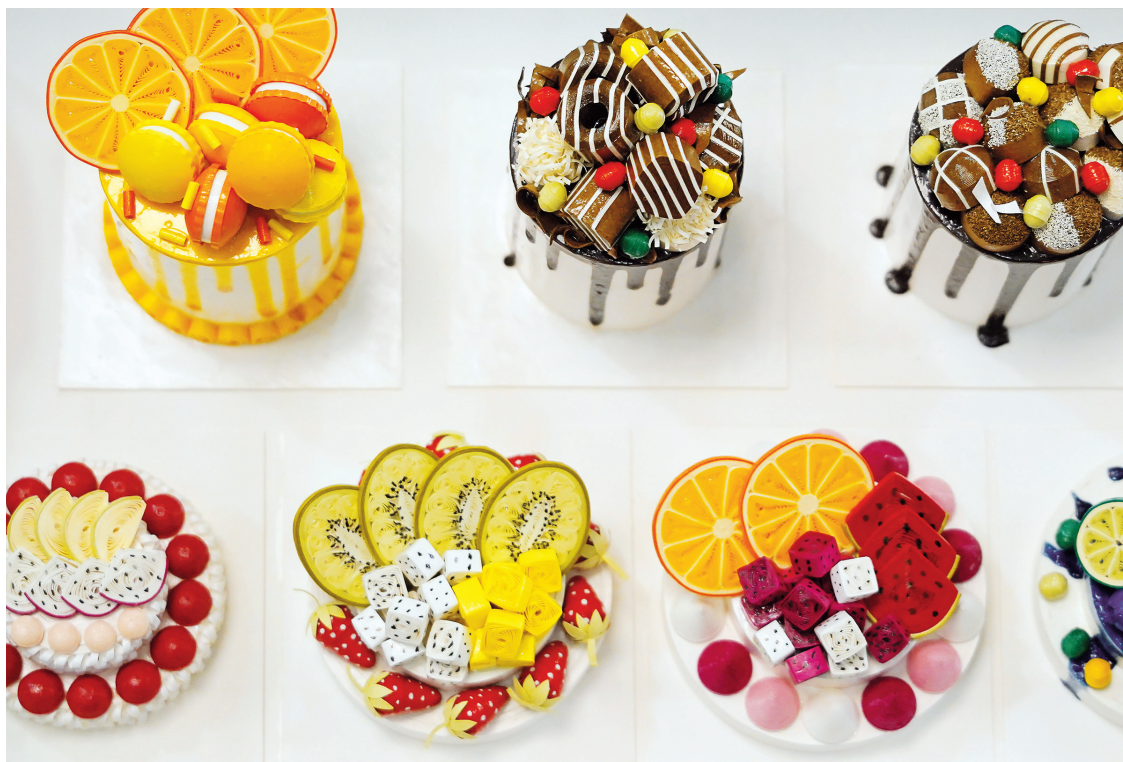
Right: Li Xiao's cake sculptures are incredibly lifelike.