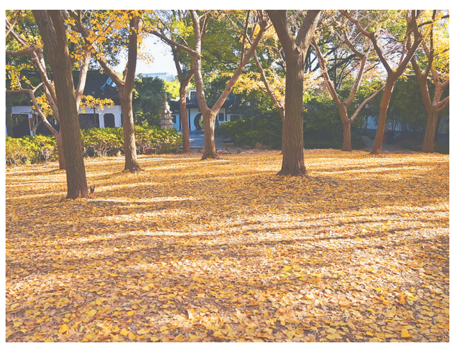
The yellow leaves of the surrounding ginkgo grove form a natural carpet. To enhance the visual experience, the garden has several "no-sweeping" areas.