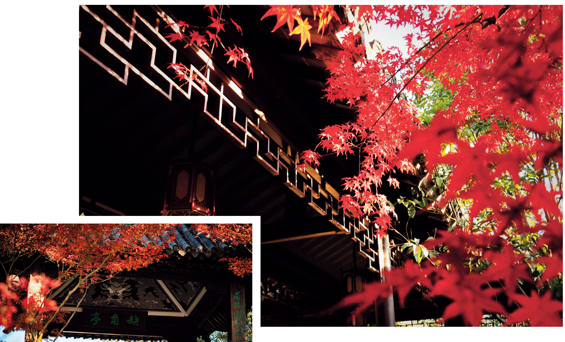
The layers of red maple trees at the Quejiao Pavilion in Guyi Garden are like a fiery red sunset, complementing the landscape of the garden, the pavilions and the towers.

As the weather cools, more than 20 types of trees in Guyi Garden in Jiading, including ginkgo, maple, hackberry and Chinese tulip trees, change their foliage color. With the many different leaves dazzling in the sunshine, the garden has become a perfect getaway for nature lovers.