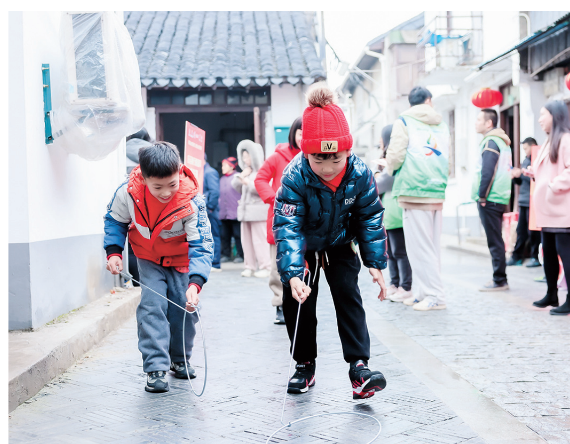
Two boys play hoop in their neighborhood. Gelong Old Street in Waigang Town hosts Chinese New Year festivities that recreate folk practices.