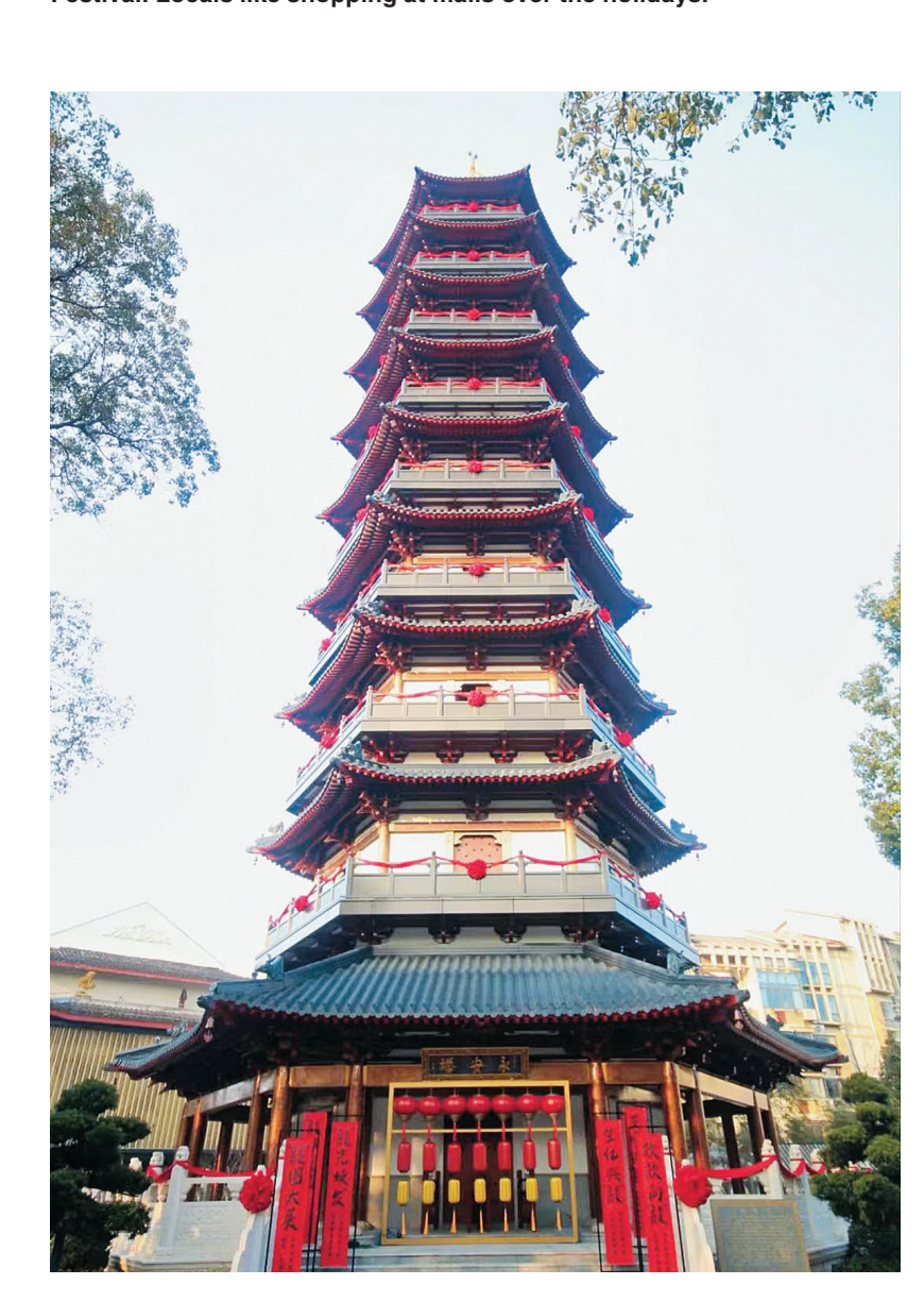
Anting Old Street is joyful during the Spring Festival with the refurbished Yong'an Pagoda's appearance.