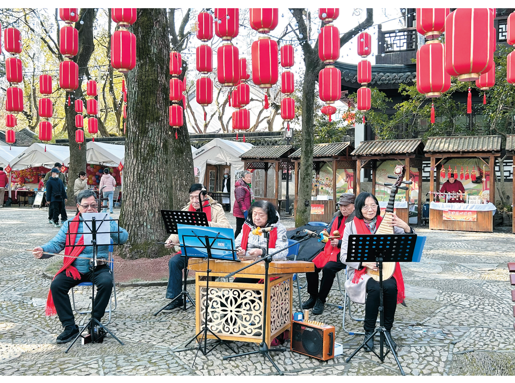
Traditional Sizhu performances at Guyi Garden fascinate guests. The Jiading classical garden hosted numerous folk activities during the Spring Festival, with the "Twelve Flower Gods" light show illuminating brightly at night.