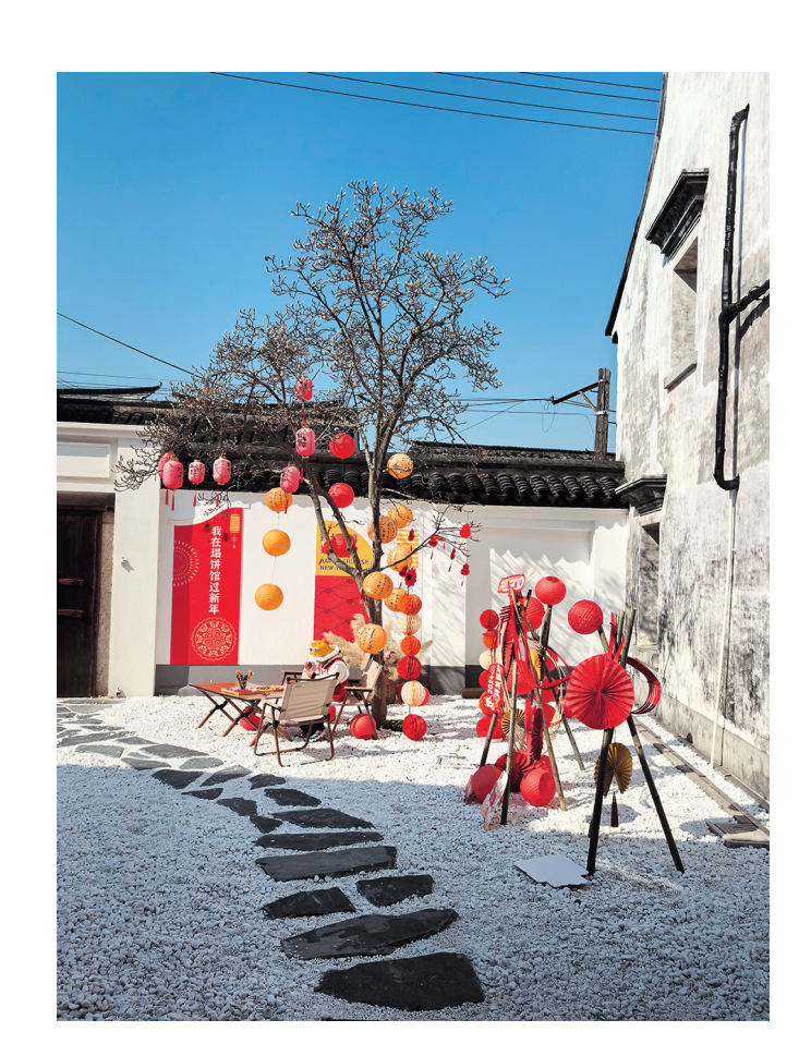
The Loutang Traditional Pancake Heritage Hall on Loutang Middle Street exudes Spring Festival grandeur and charm.