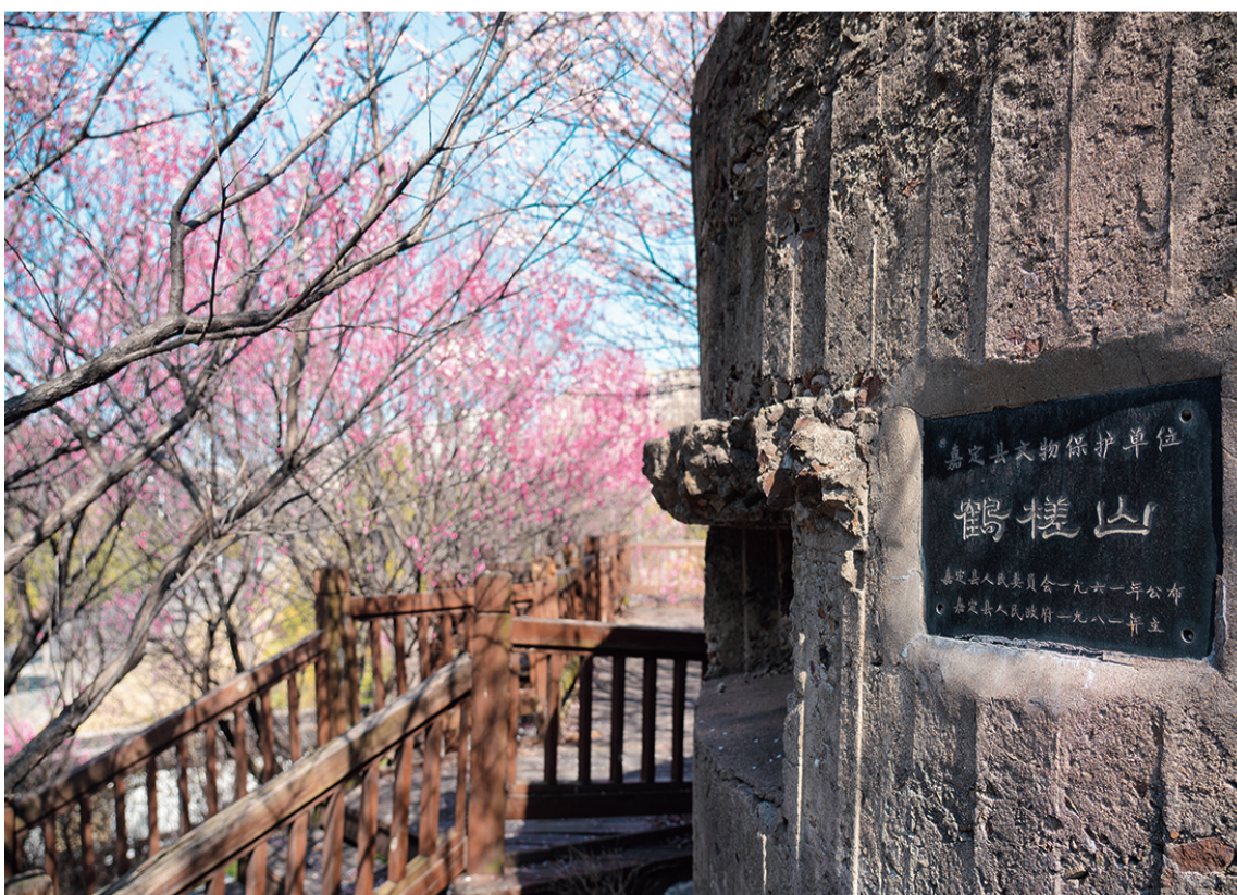
Hecha Dune, one of 18 designated scenic spots in Nanxiang Town, Jiading, is bursting with a vibrant display of red plum blossoms. — Li Qi