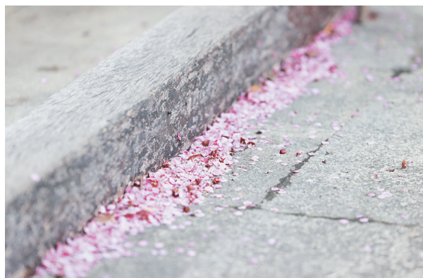
Fallen plum blossom petals create a carpet of pink beside the road.