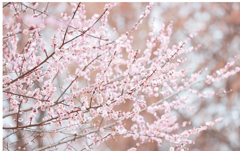
Along Bai'an Highway and Hengrong Road, the clusters of plum blossoms attract bees with their sweet scent. — Zhou Hong