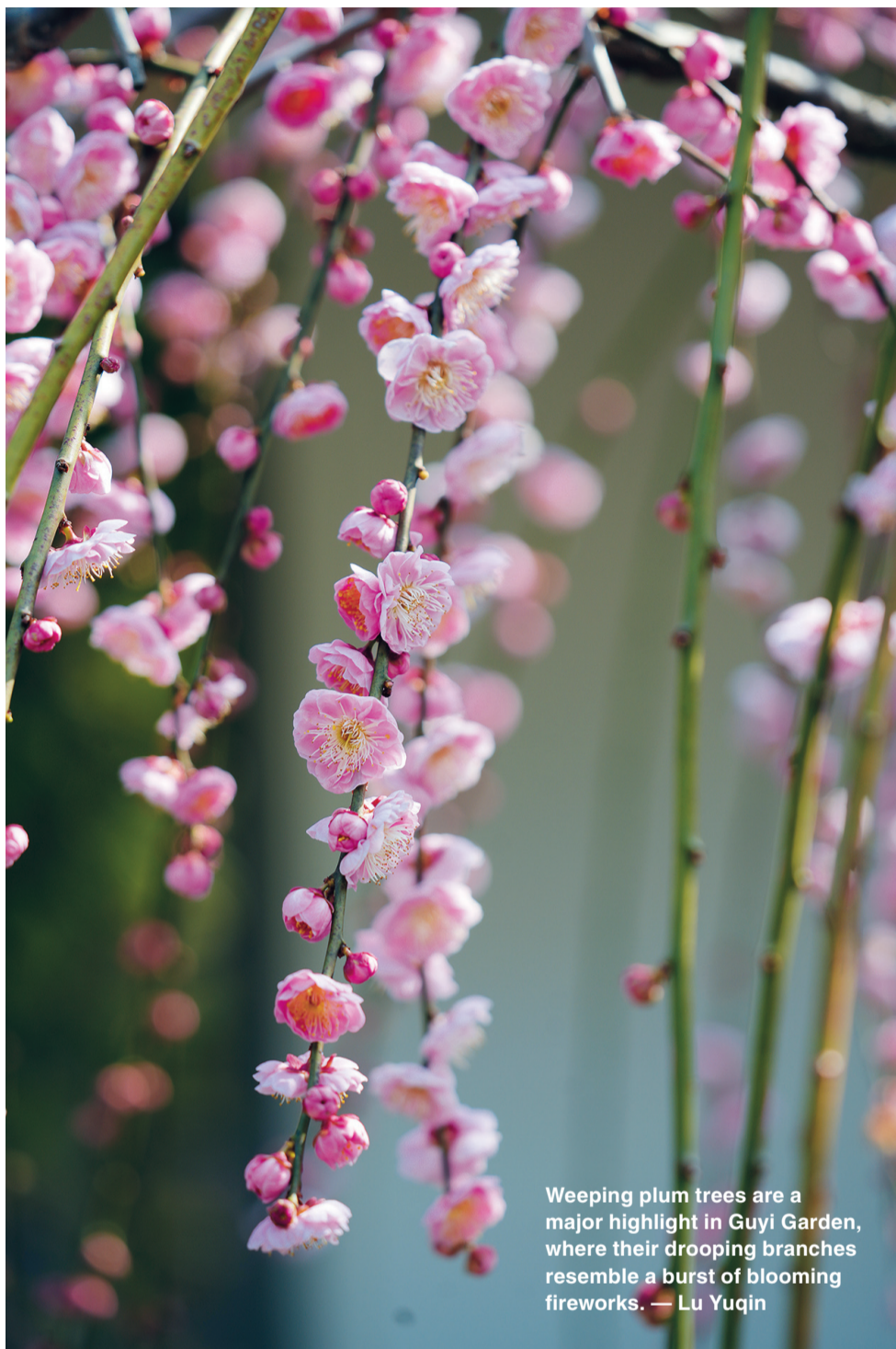
Weeping plum trees are a major highlight in Guyi Garden, where their drooping branches resemble a burst of blooming fireworks. — Lu Yuqin