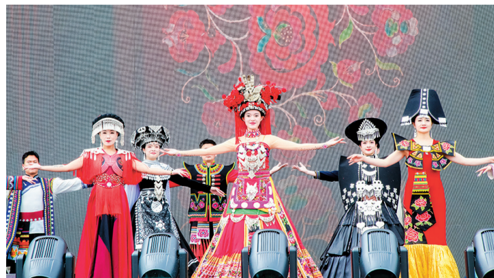
Performers dazzle at the F1 Chinese Grand Prix with ethnic dance and costume presentations. — Si Shushu

County performed their original Hakka dance “The Blessed Mountainous Village,” with performers carrying bamboo-woven baskets filled with rice, flowers and sweet potatoes. At times they