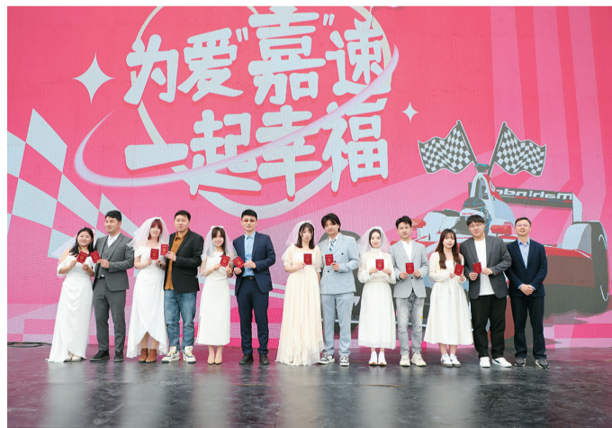
A group photo of the six couples after receiving their marriage certificates. — Si Shushu