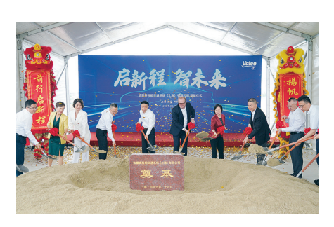
Groundbreaking ceremony for Valeo plant in the Waigang Industrial Park