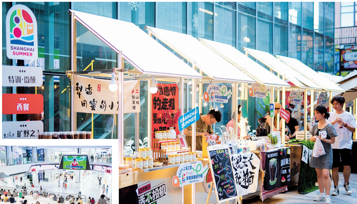
Above: More than 100 merchants gather at Xiyun Lou's summer night market with their varied consumer offerings. — Peng Xiaoyan

Nanxiang Incity Mega Mall, Shanghai's largest single-structure shopping mall, features not only restaurants and cosmetic brands but also a theater and an ice rink. The comedy production company Mahua FunAge has its first performance venue here. Children can get the