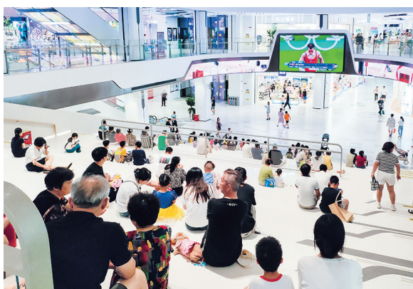
Inset: The tiered seating at Phase II of LifeHub@Anting provides a refreshing retreat during the summer.

chance to experience role-playing activities and theater performances. At the All Star Ice Skating Club, visitors can enjoy figure skating, ice hockey and curling.