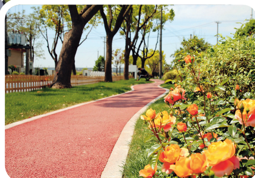
▶ Luxiang Community