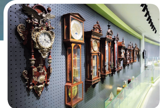
▲ Dalai Time Museum