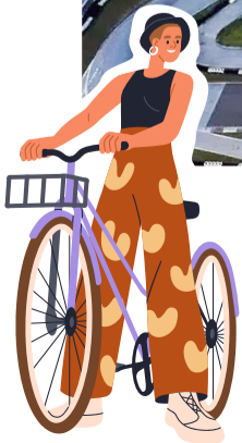
▲ Shanghai International Circuit