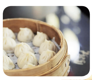
▲ Xiaolongbao (small steamed buns)

nally, cycle your way to Guyi Garden. The garden's natural scenery harmonizes beautifully with the Ming Dynasty (1368-1644) architecture.