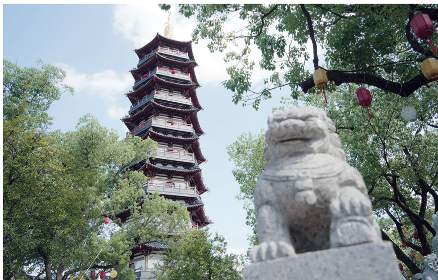
Climbing Yongan Pagoda offers a panoramic view of the charming Anting Old Street.

Admission: 20 yuan (Reservation is required and can be made via the WeChat account of 汽车城文旅)