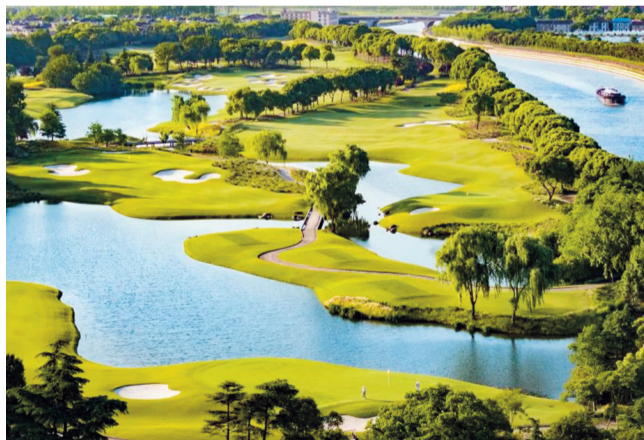
A view of the Enhance Anting Golf Club in Jiading

The 30th Volvo China Open will take place from April 17 to 20, 2025, with a prize purse of US$2.5 million. This marks the tournament's return to