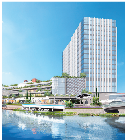
Sasseur's Jiading outlet aims to become a new commercial landmark and driver of regional growth.

The large-scale super outlet mall will also fully implement the ESG (environmental, social and governance) sustainability concept.