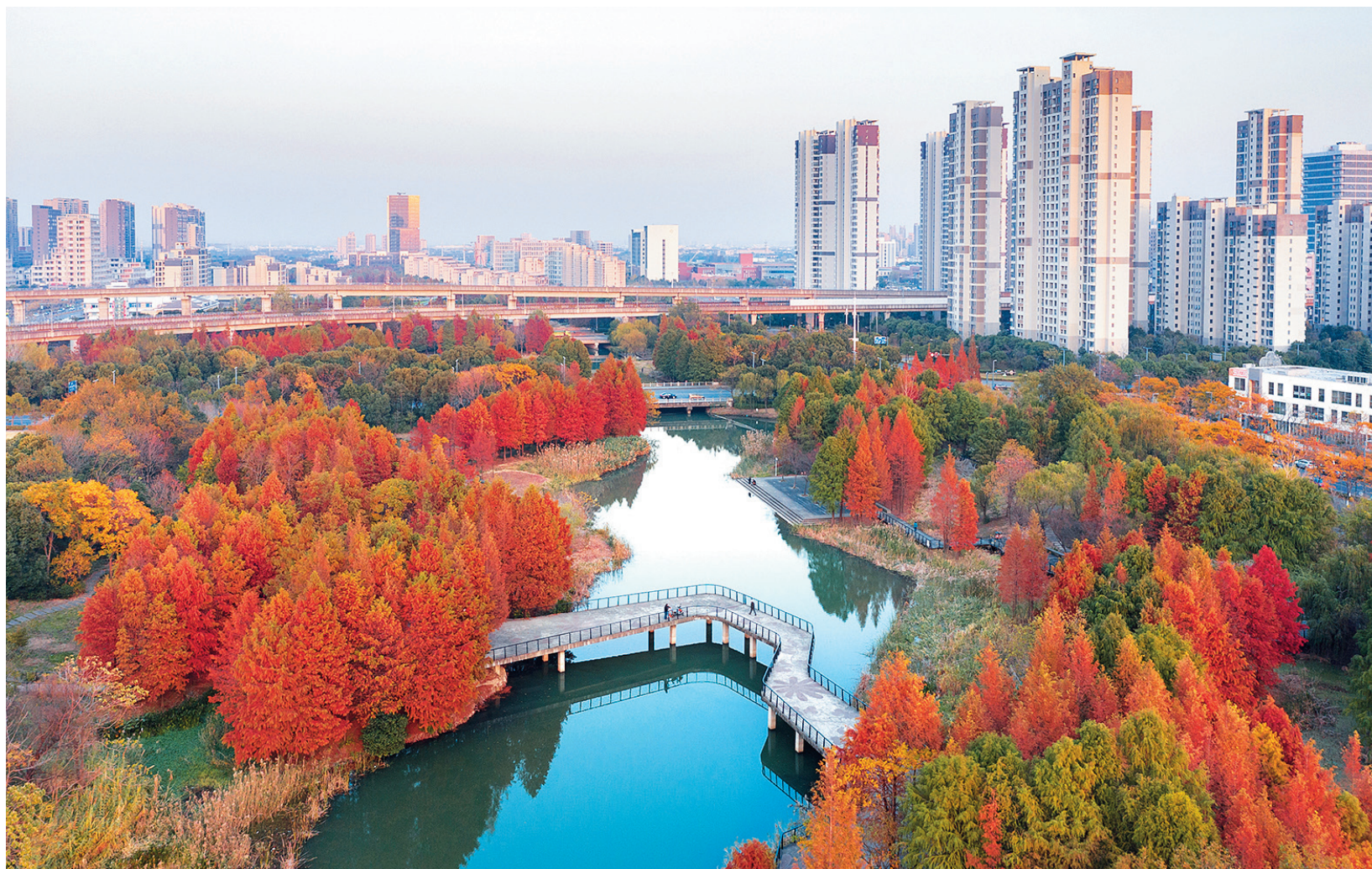
The lake reflects the distant golden hues, while the colorful leaves craft a unique poetic charm on a warm Sunday afternoon at the Shigangmengtang Leisure Park in Jiading New City. — Li Qi