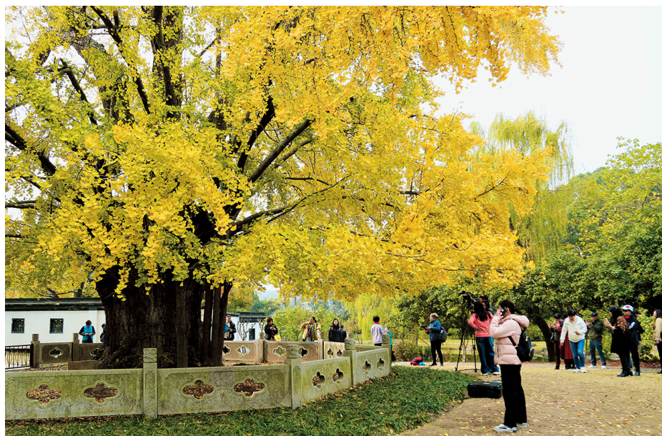
Designated as No. 0001 ancient tree in Shanghai, the ginkgo tree in Jiading's Anting Town is over 1,200 years old. — Dai Yixin

As winter deepens, Jiading New City transforms into a painted masterpiece. The woodlands become a vibrant tapestry of deep greens, golds and oranges. In Qiuxiapu Garden, ancient trees and pavilions abound. Maple leaves dance like flames, casting a pinkish glow, while golden ginkgo trees stand resplendent. For a touch of seasonal spirit, visit the Bodhi Temple, home to six ginkgo trees over 300 years old.