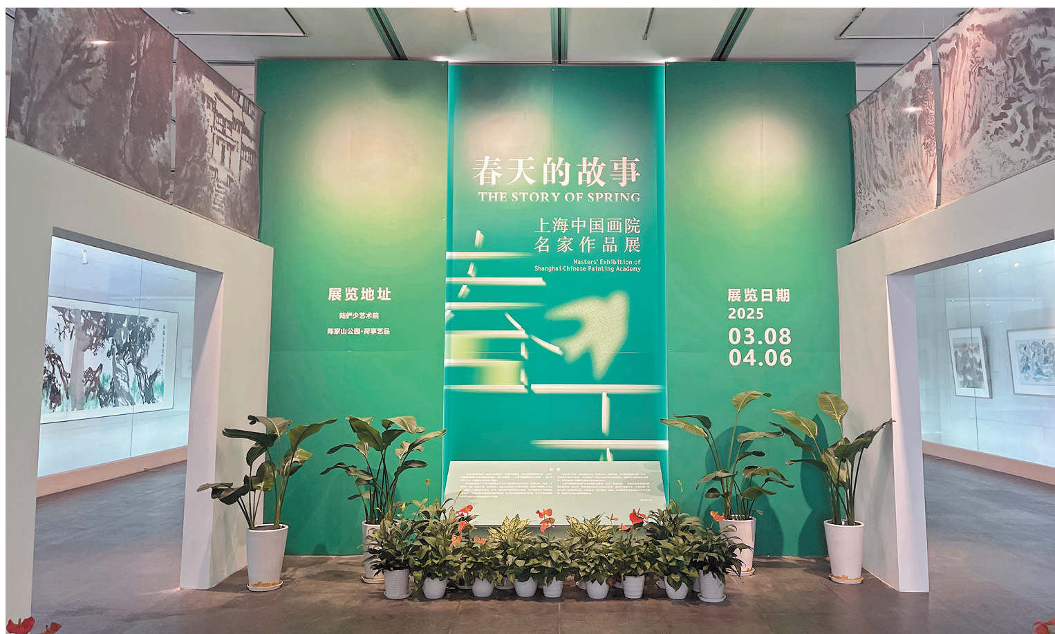
"The Story of Spring," running until April 6, features works by master painters from the Shanghai Chinese Painting Academy.