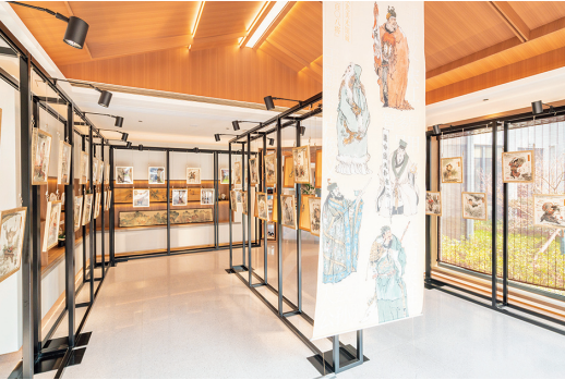
Yuanxiang Cultural Source Station