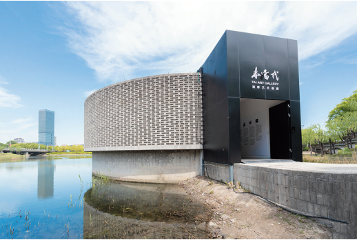
Tai Art Gallery

The lakeside gallery was formerly a well-known dock at Yuanxiang Lake. The exhibition hall receives natural light from the dock’s ceiling, which is cleverly converted into a skylight. This light plays with the white-walled gallery and ink-and-wash artworks to create a harmonious artistic atmosphere. The gallery, inspired by Yuanxiang Lake’s ecological landscape, hosts art exhibitions, aesthetic education, small concerts, art therapy, salons, markets, outdoor family activities, brand events and a café.