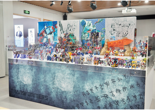
Jiangqiao Culture and Sports Service Center

Address: Bldg 6, 2755 Huyi Highway Opening hours: 10am-9pm on workdays; 9am-9pm on holidays