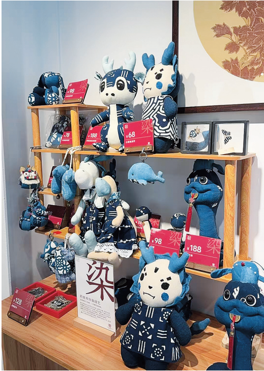
Yiquhui ICH Handicraft Experience Hall

Opening hours: Tuesday-Sunday, 9am-5pm Address: Southwest corner of Yinxang Lake Park