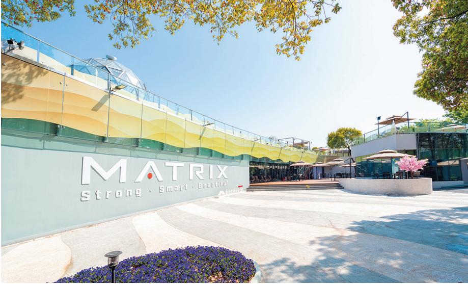
Johnson Fitness and Cultural Center

Nestled among the greenery of Malu Grape Art Village in Jiading, the experience hall stands quietly, serving as a living cultural post. This innovative space can accommodate