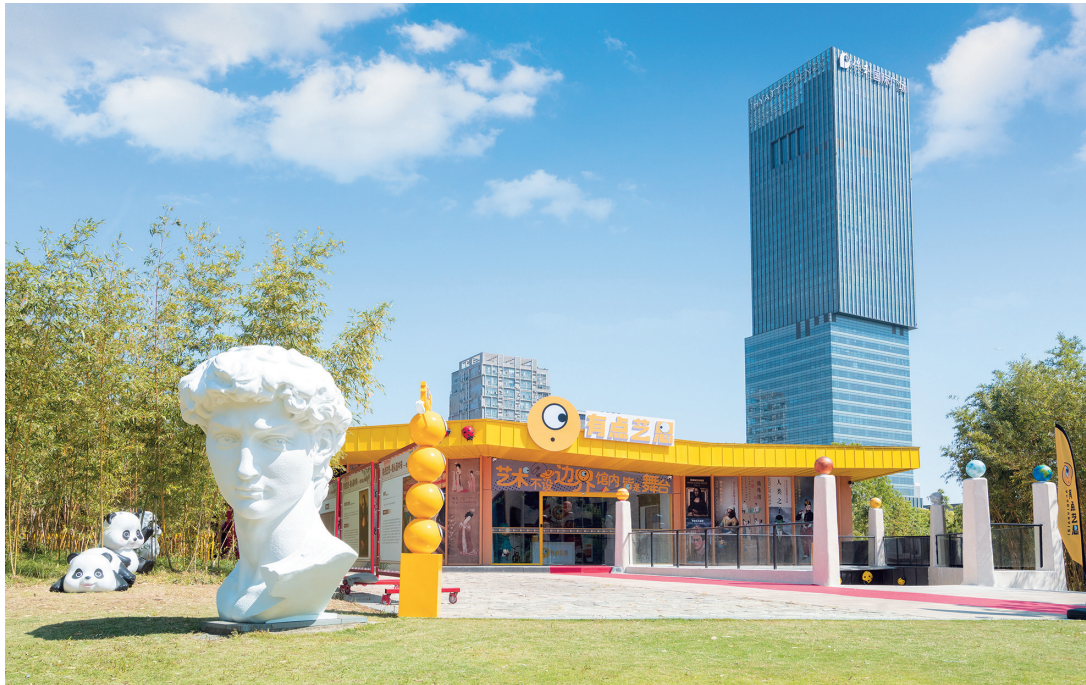
Youdianyisi Wax Museum

a variety of themed activities to create an immersive art experience for the public, including cloisonné enamel, batik, rubbing, scented candles, wax painting and sculpture.