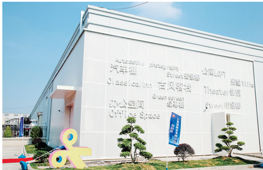
The digital center for micro-short plays offers eight permanent sets. — Si Shushu

"Micro-short plays are typically less than 10 minutes in length with a straightforward plot, a small cast, a low production cost and a short production cycle," said Dong Mingzhe, a representative of the Shanghai International Short Video Center.