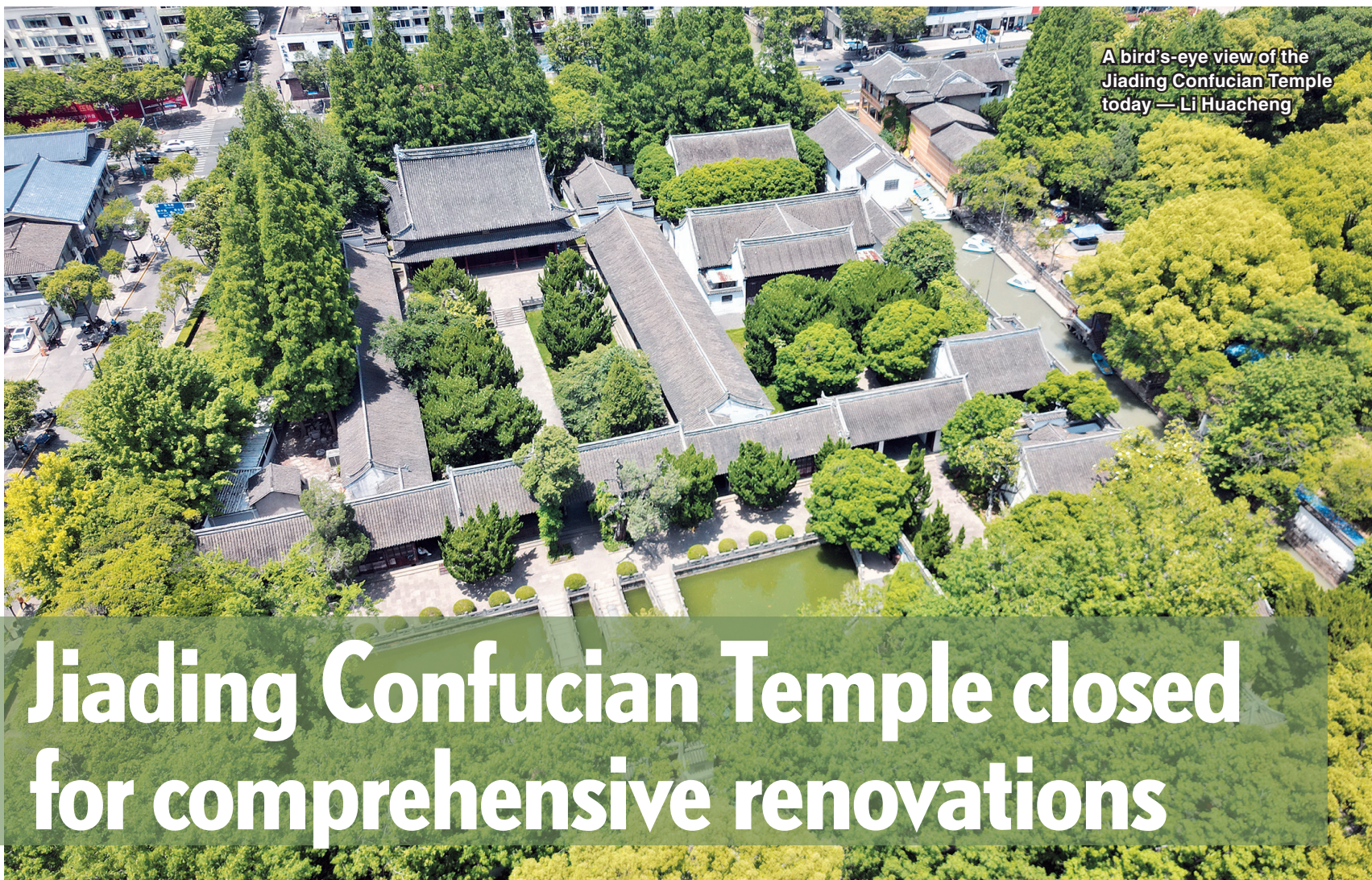
A bird's-eye view of the Jiading Confucian Temple today — Li Huacheng