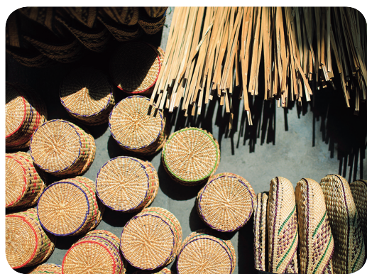
XUZHANG straw weaving