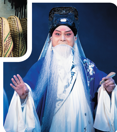
KUNSHAN Kunqu Opera