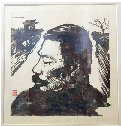
Chen Gukui's woodblock print is a tribute to Lu Xun, a pioneer of modern Chinese literature. — Dong Hong