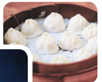
NANXIANG steamed buns