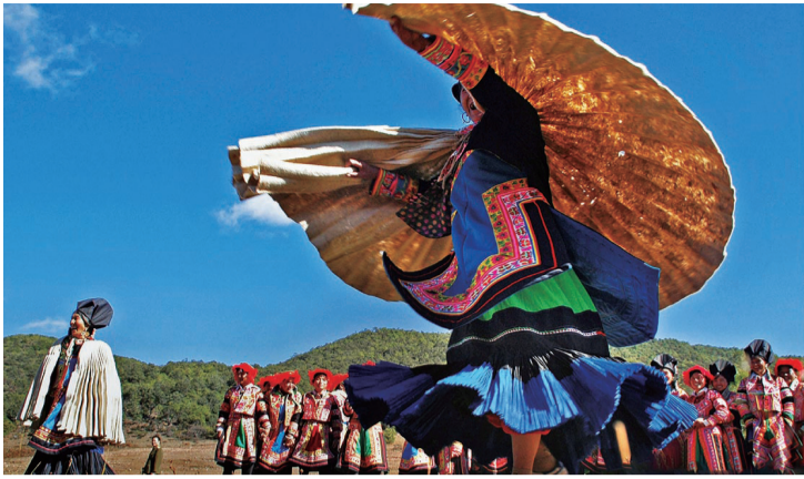
Yi costumes from Yuanmou County in Yunnan Province