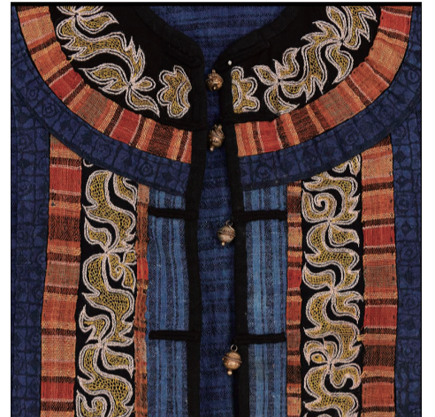
Embroidery on the chest of a women's jacket from Yunnan's Funing County

With ancestral embroidery skills, Yi people needle nature designs onto their