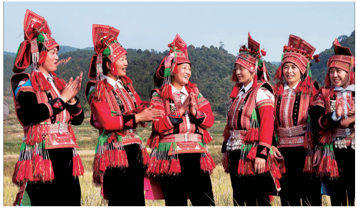
Women's costumes from Yunnan's Shiping County