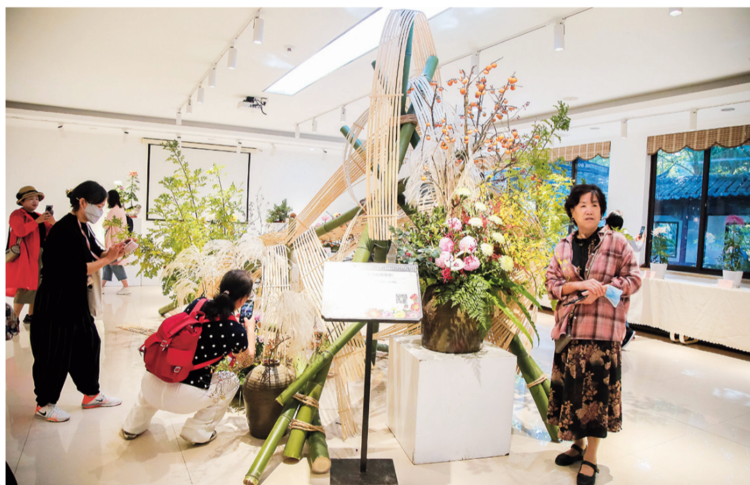
At the Huilongtan cultural activity room, a large-scale floral work that combines flower arrangement and bamboo art attracted visitors. — Si Shushu

The 19th Jiading Chrysanthemum Exhibition just ended at Huilongtan Park, with some 100 varieties and 30,000 pots of chrysanthemums attracting crowds of visitors. Chrysanthemums are considered one of the “four gentlemen” plants in Chinese culture, along with orchids, plum blossoms and bamboo. For those who missed the exhibition, we reproduce some photos of the blooms for you to appreciate the unique charm of the flowers that span a spectrum of colors and shapes.